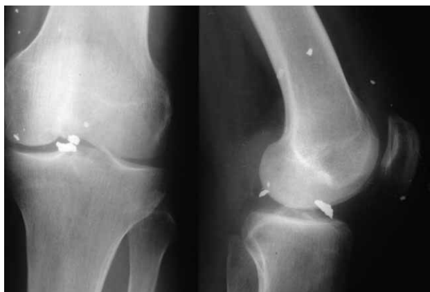
Fig 1. a) Anteroposterior and b) lateral radiographs of the knee joint with anchored metallic foreign body in the bone.

Despite of contaminated foreign body in the joint we did not observed any knee infection.