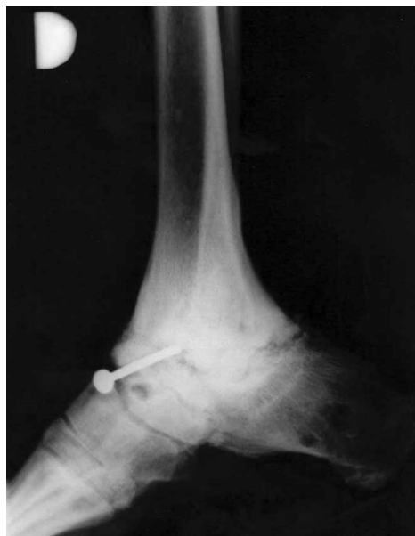
Fig. 3. Lateral radiographs of the ankle 10 months after second operation showed bone consolidation in the arthrodesis region.

Total dislocation of the talus (i.e. tibiotalar, talonavicular and talocalcaneal disruption) is an uncommon injury and has been reported in approximately 0.06% of all dislocations and 2% of all talar injuries 3,4 . It is an extremely rare injury because of its deep position in the foot, the strong ligamentous support and the amount of force required for its dislocation 5,6 . Total talar dislocation is usually an open injury 5 . The talus is predisposed to dislocation because of its anatomical characteristic: it is the only bone in the lower extremity without muscle attach-