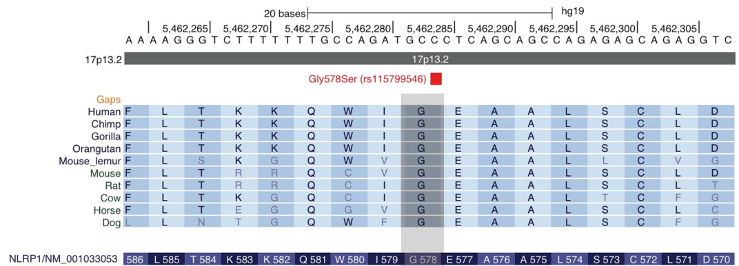
Figure 2. Genomic context and evolutionary conservation of NLRP1 homozygous variant identified in primary NLRP1 family 1 (Fig. 2). Variant affects amino acid position 578 in NLRP1 gene evolutionarily invariant in all mammal datasets in the UCSC Genome Browser conservation chain.

In both reported cases, diagnosis of MS was established in accordance with McDonald criteria 6 . Both patients were treated with pulses of high-dose methylprednisolone at the time and both responded favorably to this treatment. No immunomodulating or other specific treatment was prescribed apart from symptomatic treatment of disease manifestations.