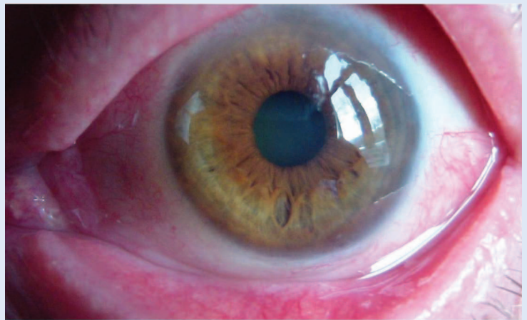
Figure 3 Clinical appearance of patient at 10-month follow up visit after treatment

In our case, the combination of surgical excision with intraoperative cryotherapy and topical chemotherapy with 0.02 % MMC application for 14 days, completed with second cycle of topical