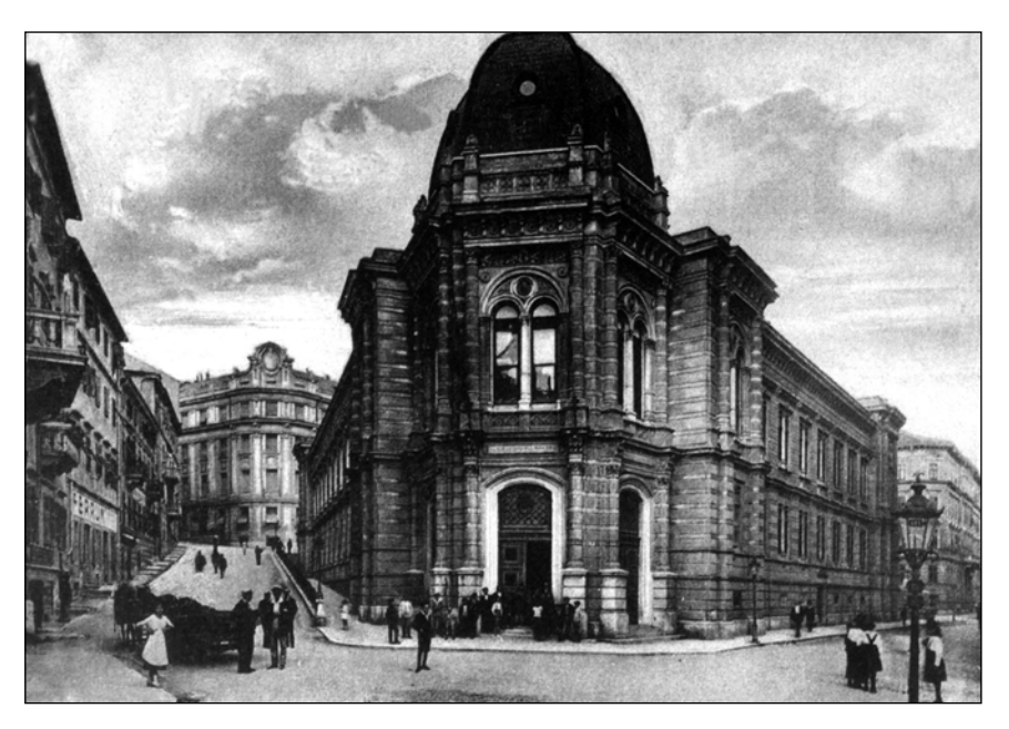
Male elementary school building (Scuola cittadina maschile) which hosted the Society's lectures, around 1910.

Zgrada Osnovne škole za dječake (Scuola cittadina maschile) oko 1910., u kojoj su se održavala predavanja Društva.