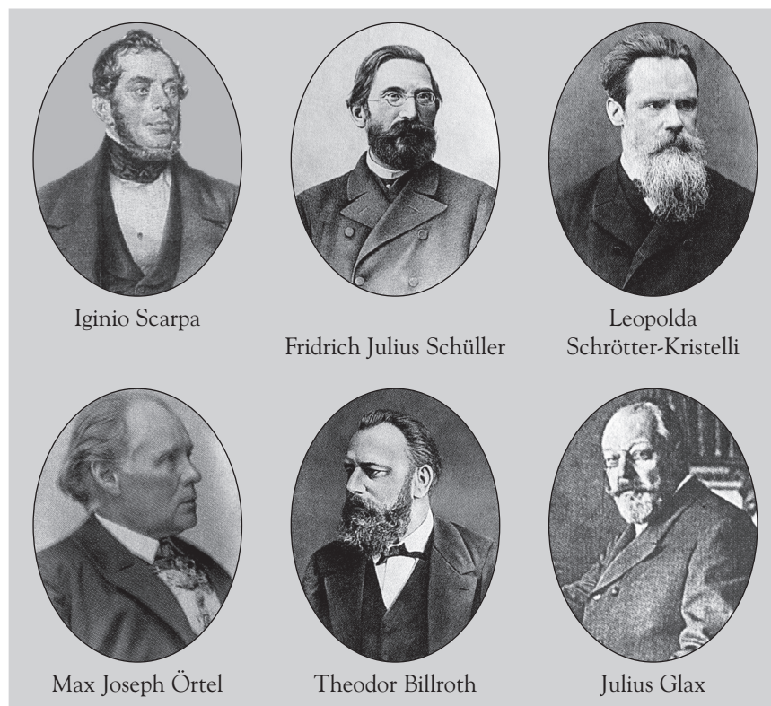
Figure 2 Advocates and promoters of Opatija as a centre of thalassotherapy