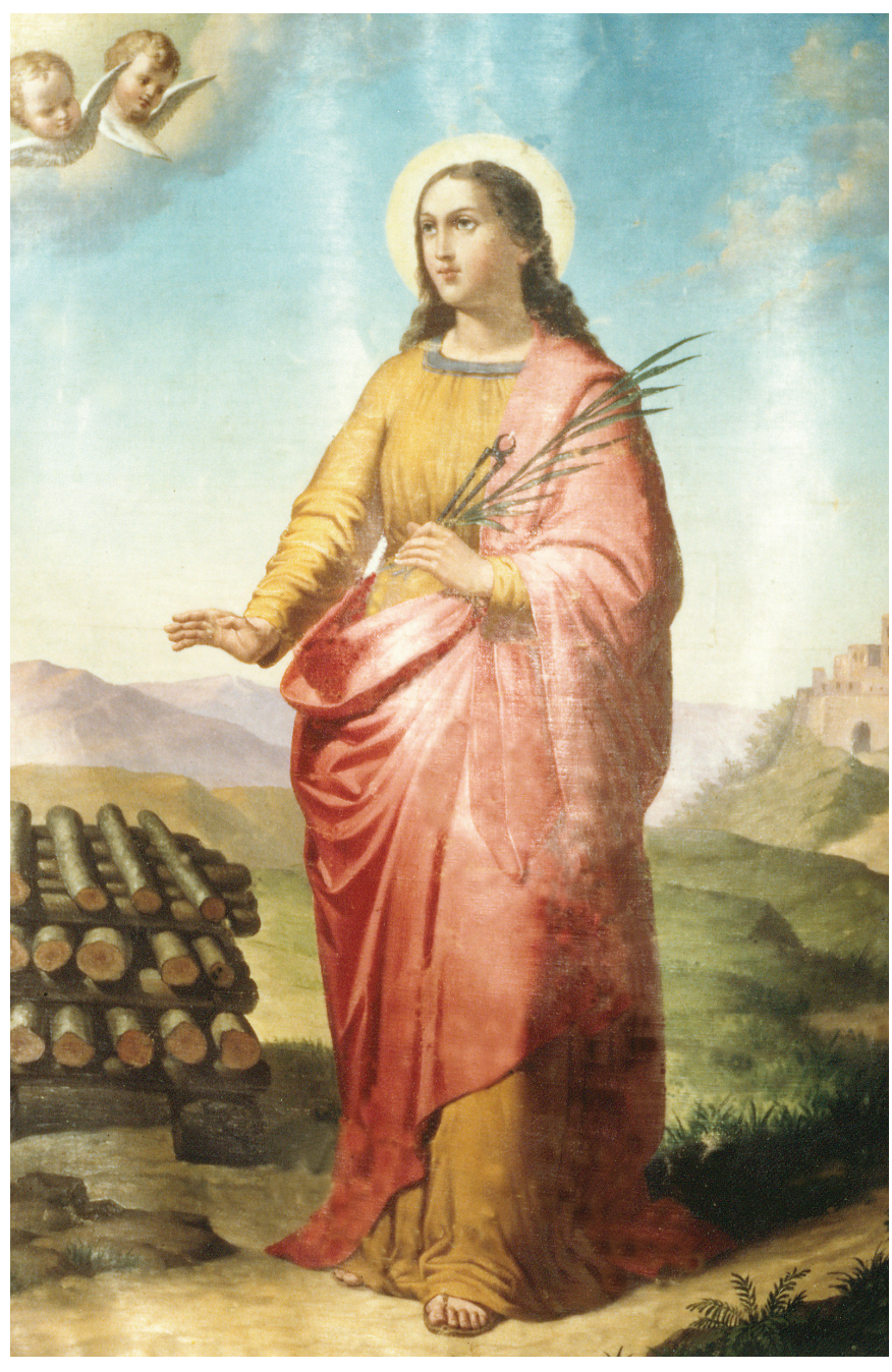
Figure 1 The traditional illustration of St Apollonia the martyr with her typical symbols