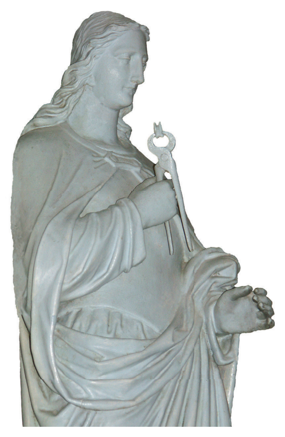
Figure 3 A marble statue of St. Apollonia in the Parish Church of St. Bartholomew in Roč.