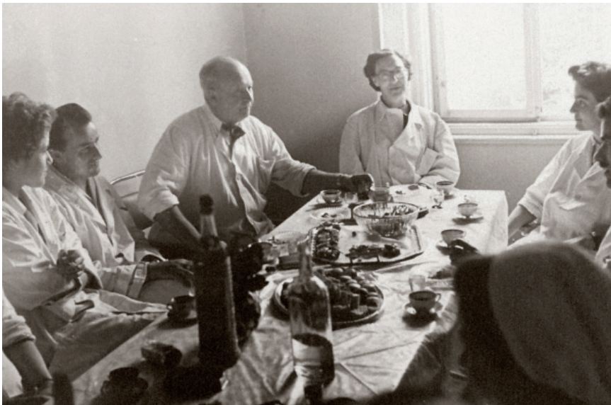
At the Clinic for Infectious Diseases with his colleagues on the eve of retirement in 1968