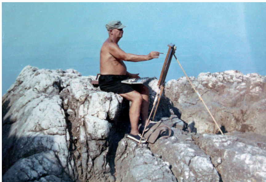
One of the pleasant days in retirement, behind the easel at the seaside on the island of Krk

Even though he had published a few notable early papers before WW2, his scientific career peaked in the postwar period. His opus includes fifteen notable research and professional papers, and shows a wide spectrum of interest in infectious diseases and contiguous areas of research, from classical infectious diseases to new epidemics and novel solutions - often his