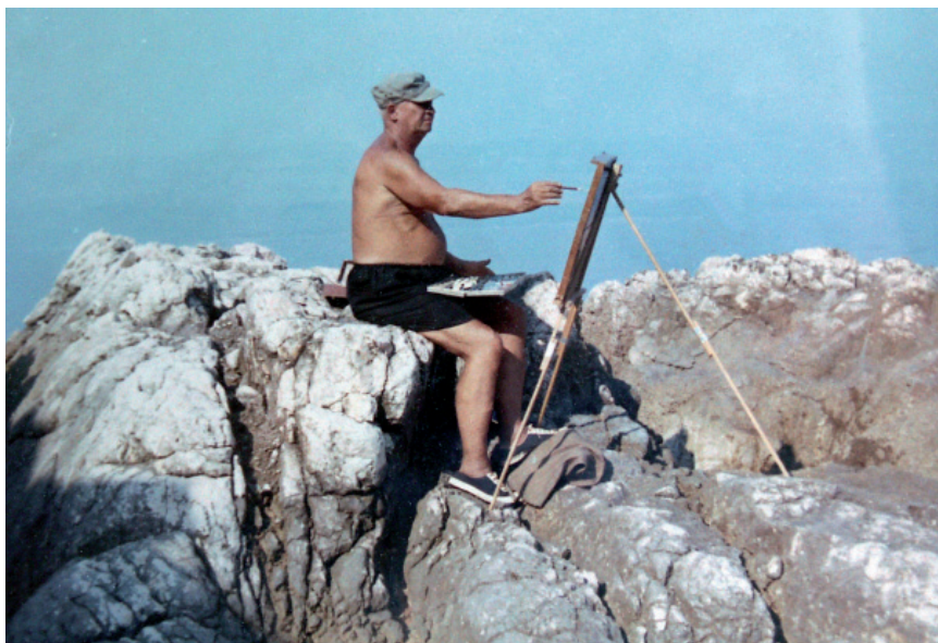
One of the pleasant days in retirement, behind the easel at the seaside on the island of Krk

Even though he had published a few notable early papers before WW2, his scientific career peaked in the postwar period. His opus includes fifteen notable research and professional papers, and shows a wide spectrum of interest in infectious diseases and contiguous areas of research, from classical infectious diseases to new epidemics and novel solutions - often his