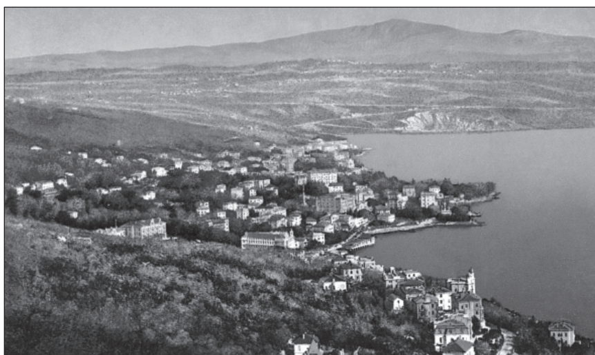
Abbazia /Opatija – the panoramic view of the Austrian Riviera, 1905.