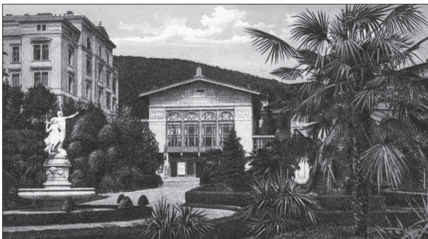
The once Hotel Stefani, nowadays Hotel Imperial and the theatre, 1905.