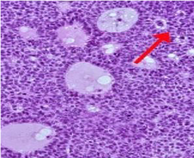
Figure 2. Histologic findings showed granulosa cells with microfollicular growth patterns and Call-Exner bodies (magnified 10 times).

third pregnancy, which ended in deliberate termination according to the couple's decision.