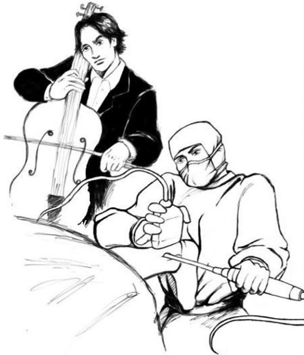
FIGURE 1. Cello technique schematic description. We named the US-guided calcaneoplasty the “cello technique” based on the visual association: the US probe as the cello and the abrader as the bow.

space that sometimes makes entry difficult, any position below the level of the posterosuperior tip of the calcaneus should suffice. The skin incision is followed by blunt dissection and insertion of an abrader (4.5-mm blade; Smith & Nephew, Andover, MA) over the top of the calcaneal prominence.