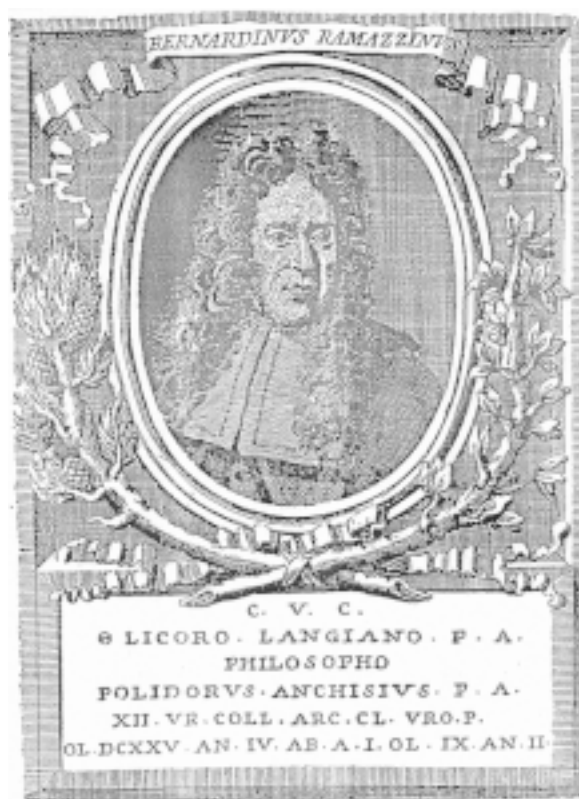
Figure 1 Bernardino Ramazzini (1633-1714), Italian physician, founder of occupational/industrial medicine

Bernardino Ramazzini (Figure 1) was born on 5 November 1633 in Carpi near Modena, Italy. He studied medicine in Parma and graduated in 1659. After that, he practiced in Roman hospitals for a while. He was offered the position of the leading physician in the little duchy of Castro, but he fell ill with malaria and withdrew to convalesce at his home in Carpi. As he got better, he accepted another offer, now from the neighbouring Modena, where he acquired the reputation of a competent practitioner and medical theorist. He was elected full professor ( professore primario ) of theoretical medicine at the local university in 1682 (at the age of 49 years). Eighteen years later, at the time of