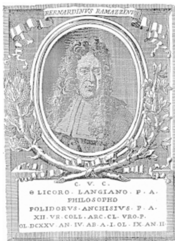
Figure 1 Bernardino Ramazzini (1633-1714), Italian physician, founder of occupational/industrial medicine

Bernardino Ramazzini (Figure 1) was born on 5 November 1633 in Carpi near Modena, Italy. He studied medicine in Parma and graduated in 1659. After that, he practiced in Roman hospitals for a while. He was offered the position of the leading physician in the little duchy of Castro, but he fell ill with malaria and withdrew to convalesce at his home in Carpi. As he got better, he accepted another offer, now from the neighbouring Modena, where he acquired the reputation of a competent practitioner and medical theorist. He was elected full professor ( professore primario ) of theoretical medicine at the local university in 1682 (at the age of 49 years). Eighteen years later, at the time of