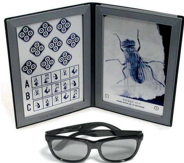
Picture 2. Titmus Wirt test

With great advances in cataract surgery, as well as intraocular lens design, and preoperative diagnostics much attention has been paid to improving postoperative optical quality. Due to those advancements postoperative anisometropia, astigmatism and aniseikonia are almost eliminated. To this day, the most frequently implanted intraocular lens (IOL) is a monofocal lens designed to provide excellent outcomes for distance, but usually, patients require refractive compensation for intermediate and near activities. In comparison to monofocal intraocular lenses, multifocal intraocular lenses (MIOLs) are designed to provide patients with an expanded range of vision and consequently reduce spectacle dependence after cataract surgery, also improving some quality of life aspects (25). The basic principle underlying the multifocal lenses is the simultaneous creation of more than one image point for a single object point. The corollary of this principle