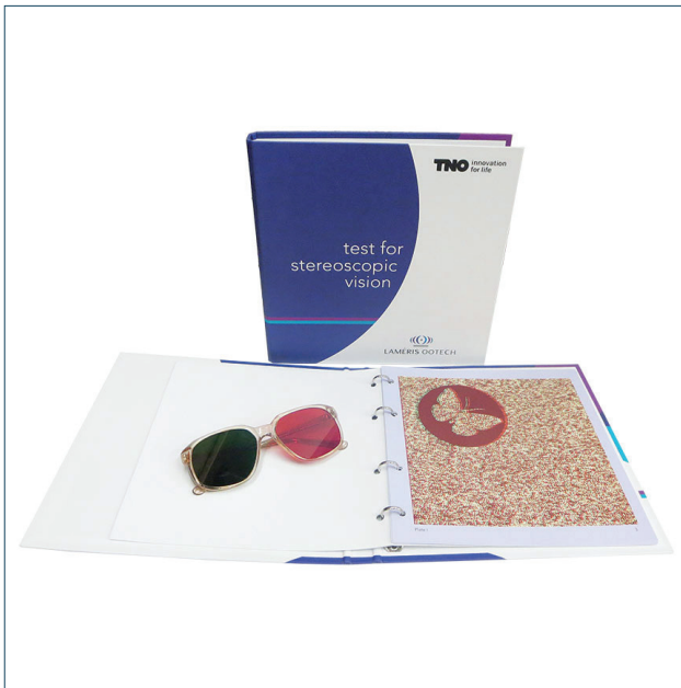
Picture 1. TNO test

rely used in clinical practice, with clinicians opting for either vectographic tests, such as the Titmus Wirth test, Randot test, or anaglyphic tests such as TNO, which is a highly dissociative stereotest that does not present monocular cues.