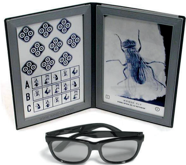
Picture 2. Titmus Wirt test

With great advances in cataract surgery, as well as intraocular lens design, and preoperative diagnostics much attention has been paid to improving postoperative optical quality. Due to those advancements postoperative anisometropia, astigmatism and aniseikonia are almost eliminated. To this day, the most frequently implanted intraocular lens (IOL) is a monofocal lens designed to provide excellent outcomes for distance, but usually, patients require refractive compensation for intermediate and near activities. In comparison to monofocal intraocular lenses, multifocal intraocular lenses (MIOLs) are designed to provide patients with an expanded range of vision and consequently reduce spectacle dependence after cataract surgery, also improving some quality of life aspects (25). The basic principle underlying the multifocal lenses is the simultaneous creation of more than one image point for a single object point. The corollary of this principle