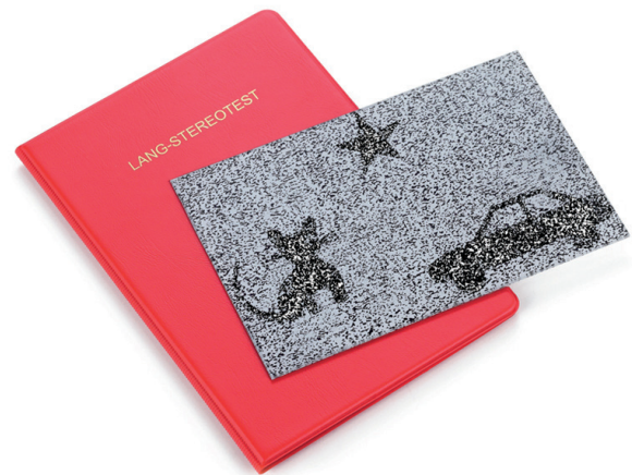
Picture 4. Lang test

In a quest to enhance visual quality and reduce unwanted side effects the idea of combining different types of multifocal intraocular lenses, the so-called “Mix and Match”, came into focus. The procedure usually involved implantation of refractive multifocal intraocular lens in the dominant eye and a diffractive multifocal intraocular lens in the non-dominant eye, other options included two bifocal diffractive lenses in which lens of lower addition is implanted in the dominant eye or a combination of the extended range of vision intraocular lens (EDOF) in the dominant eye and diffractive bifocal lens in the nondominant eye. It was reported that those combinations could enhance reading acuity, reading speed and near stereoacuity without obvious photic phenomena con-