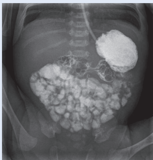
Figure 1. Anteroposterior view of abdomen during upper gastrointestinal contrast study shows the whole small intestine filled with contrast. This suggests no significant obstruction is present at duodenal level.

DOL she started vomiting after feeding. A nasogastric tube was placed resulting in drainage of green fluid through the tube, indicative of an obstruction below the level of the papilla of Vater. Abdominal radiography showed excessive gas in the stomach, but the “double bubble” sign was absent. Upper gastrointestinal contrast study showed no signs of obstruction (Figure 1). Par-