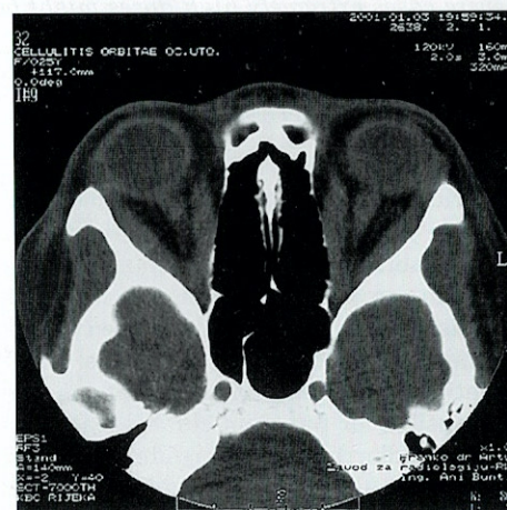
Fig. 3. Orbital axial CT scan prior to therapy showing bilateral proptosis and enormous extraocular muscles enlargement

analysis revealed a primary myogenic pattern. Electrocardiogram (ECG) examination was normal. On 13. hospital day she was transferred to Department for immunologic disorders with the diagnosis of possible acute polymyositis syndrome. Pulse dose of 1000 mg methylprednisolon was started and fever critically fell down. Enzyme-linked immunosorbent assay (ELISA) IgM Trichinella test was positive and IgH highly suspicious.