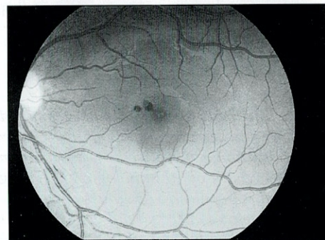
Fig. 2. Fundus photography showing vasculitis and retinal haemorrhages