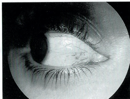
Fig. 1. Conjunctival vascular congestion over a thickened medial rectus muscle

Anamnestic epidemiological data directed to Trichinellosis and some similar cases in neighboring was categoric negative. In spite of normal eosinophils, negative epidemiological history, and non-respond to corticosteroid therapy, serologic examination for Trichinellosis was indicated. In meantime, high fever persisted, weakness of muscles was progressing to lumbal region and patient was unable to walk. Electromyoneurographic (EMNG)