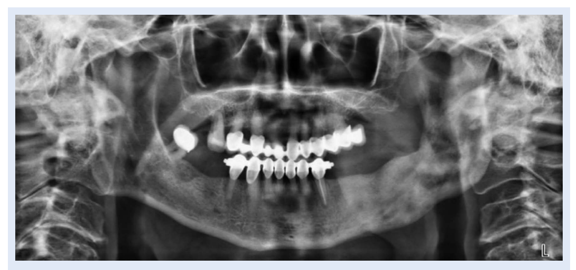
Figure 2. Orthopan showing the condition after impacted tooth extraction. Note the lesion involving left mandibular corpus, angle, and ascending ramus of the left mandible.

due to the recurrent painful symptoms with pain intensity 8\10 on the pain scale. A combination of acupuncture treatment and pain medications were administered as well as the recommendation of neurological and otorhinolaryngological examination because of the possible trigeminal neuralgia diagnosis. Within a 2 year period, her symptoms progressed to the point where her left side of the face was visibly enlarged and swollen. The patient was noticeably thinner due to the poor food intake. In December, 2018 the panoramic radiography confirmed left mandibular jaw lesion 2 x 2 x 0.3 cm³ with ill-defined margins and long transition zone (Figure 2). The computed tomography (CT)