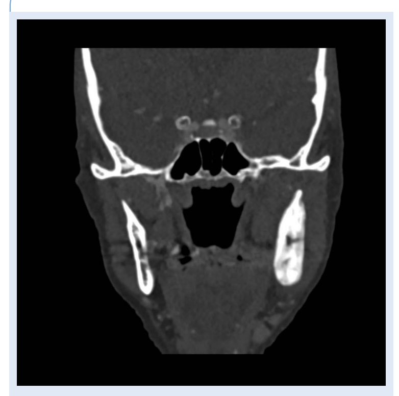
Figure 3. DECT, coronal plane of the viscerocranium. Notice the asymmetry at the expense of a more voluminous representation of the left mandible.

scans showed evident asymmetries of the left side due to the pathological remodeling of the bone in a form of a ground glass and a hypodense lesion without infiltration of soft tissues, which, according to the morphological picture, corresponds to fibrous dysplasia (Figure 3). The incisional biopsy of lesion was performed in January 2019 and specimen was sent to the pathology department which found fragments of sclerotic bone with osteoid deposition. Due to unclear finding, the patient underwent biopsy by needle punction and aspiration of the bone marrow with clinical suspition of rare genetic disease, IgG4-related disease or possible tumor. All of the hematological parameters were normal as well as the repeated biopsy of the mandible with no evident tumor. In March, 2019 PET scan of the body revealed nodule 11 x 15 mm in the upper left lobe of the lung with high pathological signal of FDG (fluorodeoxyglucose) metabolism. Futhermore, several small FDG negative nodules suspicious of primary malignant process with satellite lesions and cavitary lesion in the upper right lobe of the lung were found. Findings were communicated to the thoracic surgery tumor board, who performed wedge resection of the left