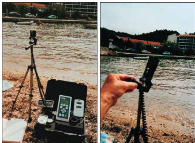
Fig. 1. Measurement of the solar radiation with professional equipment.

evening in order to answer whether the exposure of the eyes to the sun radiation has healing or harmful effect to the human retina.