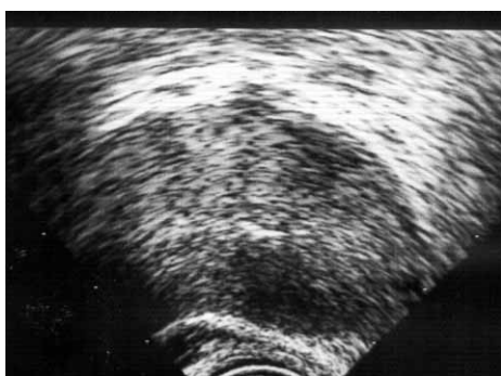
Fig. 1. Transrectal sonography showing two hypoechoic prostate cancer lesions in the left prostatic lobe