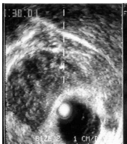
Fig. 2. Transrectal sonography showing a false positive finding in chronic prostatitis.

In the first period by TRUS we have made an exact diagnosis of prostate cancer (Figure 1) in 18.97% (107) of patients what was confirmed by biopsy. 4.61% (26) were false positive (Figure 2) and 11.34% (64) were false negative. In the second period prostate cancer was recognized in 30.34% (1723) of patients, confirmed by biopsy. False positive cases were 6.11% (347) and false negative 29.31% (1664). Sensitivity of transrectal sonography in the first period was 62.57%, specificity 94.2%, accuracy 86.2%, positive predictive value 80.45% and negative predictive value 87.72%. In the second period sensitivity was 50.87%, specificity 91.93%, accuracy 73.84%, positive predictive value 83.24% and negative predictive value 70.39%. Based on our experience prostate cancer is mostly found in the peripheral zone (Figure 3). Smaller tumors are hypoechoic and bigger tumors are hyperechoic.