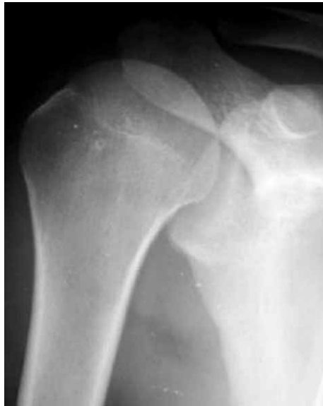
Fig. 1. Standard x-ray of the right shoulder reveals normal radiographic structure of the proximal humerus.

PCR revealed a monoclonal B-lymphocyte population. The patient was treated successfully with radiotherapy alone.