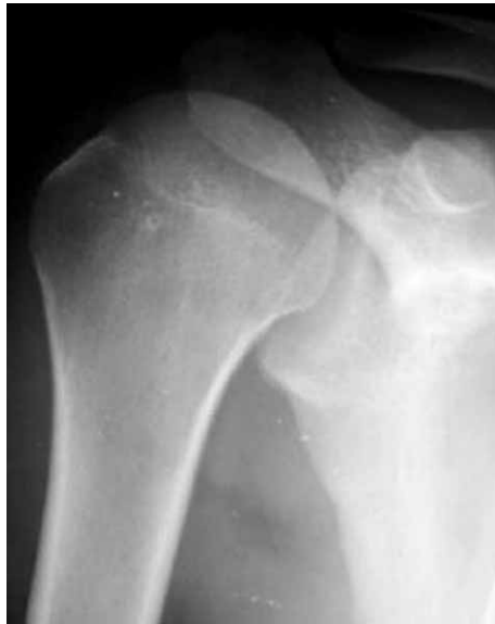
Fig. 1. Standard x-ray of the right shoulder reveals normal radiographic structure of the proximal humerus.

PCR revealed a monoclonal B-lymphocyte population. The patient was treated successfully with radiotherapy alone.