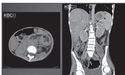
Figure 1. Abdominal computed tomography scan

Psoas abscess (PA) is an extremely rare pathology in children, particularly as complication of the Crohn's disease (CD). (1,2) With its non-specific symptoms and insidious course, PA is often diagnosed late and with late adequate treatment. The primary PA (caused by haematogenic or lymphatic spread from remote locations) should be distinguished from the secondary PA (direct spread of the infect from nearby tissues). (2) The primary PA predominates in undeveloped countries and in children, while the secondary PA predominates in