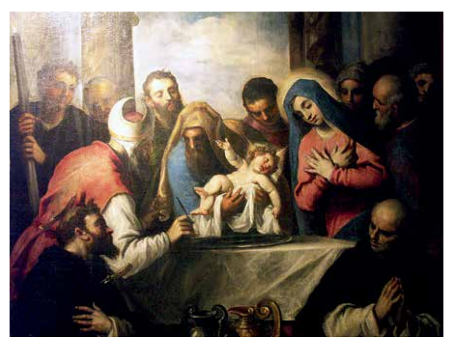
Figure 2. Circumcision of Christ, detail. Jacopo Palma Jr. 1607. Church of St. Dominika, Trogir. Slika 2. Obrezanie Krista, detali, Jacopo Palma Ml. 1607.

elegant pruning knife. Opposite them stands Mary in prayer. In the background, there are several undefined extras, and in front, in the lower part of the picture, two Dominicans are praying devoutly.