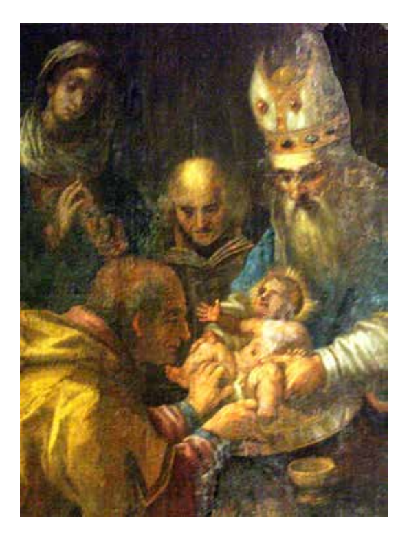
Figure 3. Circumcision of Christ. Pietro Mera (?), 17<sup>th</sup> century. Monastery of St. Katarine, Split.

Slika 3. Obrezanje Krista. Pietro Mera (?), 17. st. Samostan sv. Katarine, Split