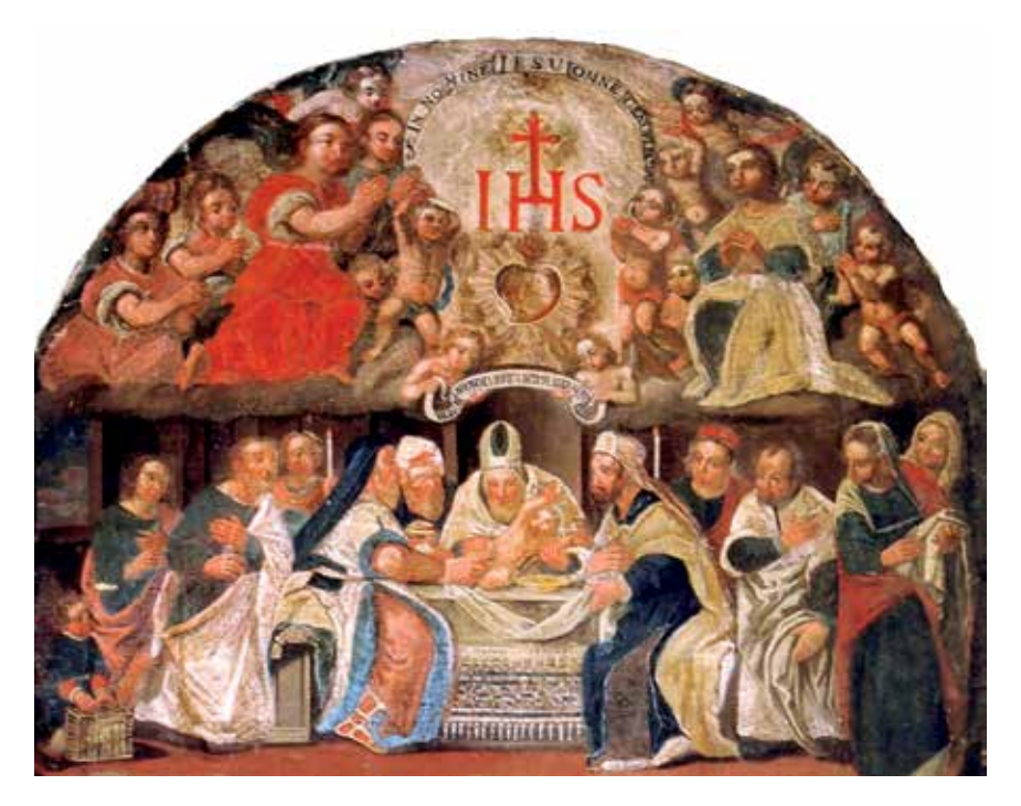
Figure 5. Circumcision of Jesus. Unknown author, 18<sup>th</sup> century. Part of the triptych Celebrating the Name of Jesus. Parish Church in the Circumcision of Christ, Labin.

Child, and the high priest prepares for the intervention with a small knife. Thanks to the number of extras and, above all, the rich staging, this presentation, as well as the entire triptych, belong to the group of younger examples in which earlier Renaissance experiences were completed. Among the presented paintings, this is certainly the most lavish, and of the world-famous reminiscent of Tintoretto's depiction of circumcision.<sup>20</sup>