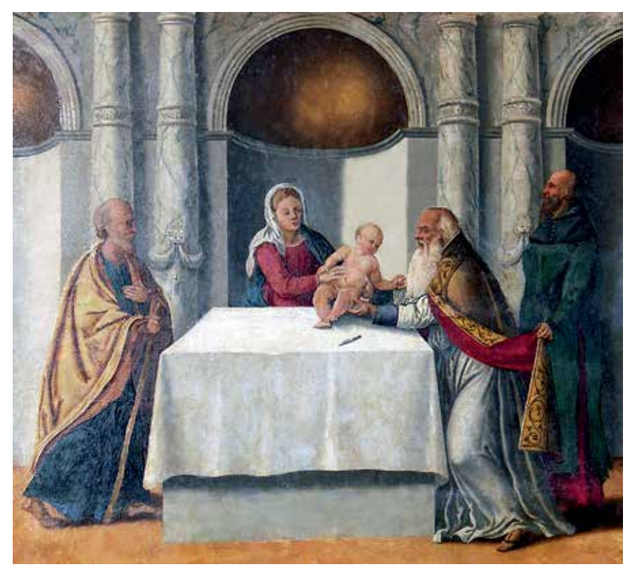
Figure 1. Circumcision of Jesus. Girolamo da Santa Croce, 1535, a detached detail from a polyptych on the main altar of the Church of the Annunciation on the island of Košljun near Punat on the island of Krk.

painting is of a smaller format. The action takes place in a Renaissance festive ambience with a special table covered with a white tablecloth on which an ordinary knife is ready for the ceremony. Unlike most similar images, only a few participants are present here. The main special feature is Mary, who exceptionally, in the middle of the frame, holds the Child and hands him over to the side-placed high priest - the mohel . This is usually done by the father and the quartermaster, who are in the background here. The father is on the side of the table, and the quarter is behind the high priest.