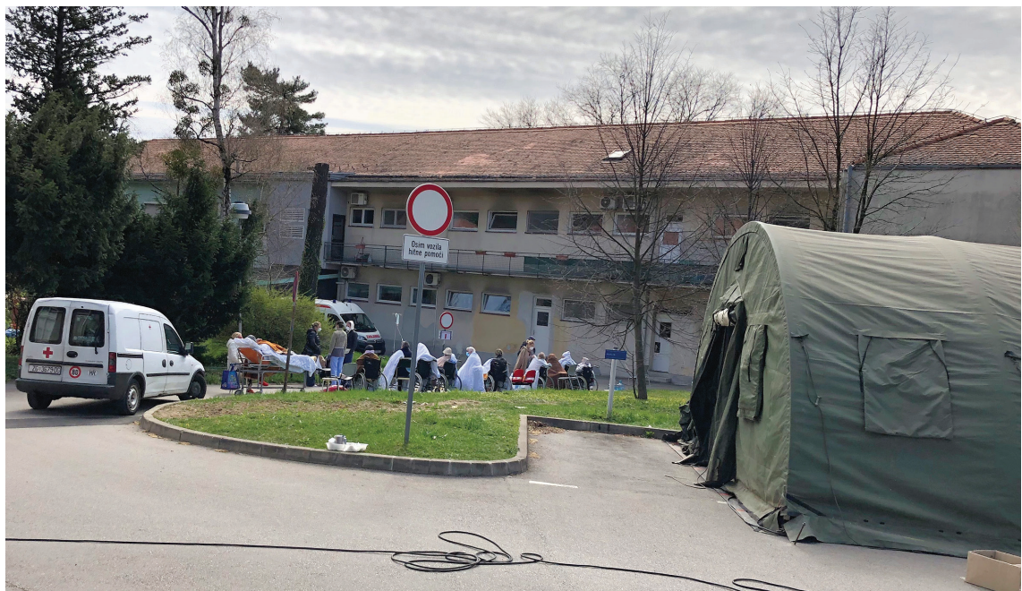
Photo: During the earthquake in Zagreb on 22 March 2020, 86 patients, including 22 COVID-19 patients, were evacuated from the extensively damaged hospital buildings (authors' photo archive, used with permission).

In addition to property damage, we were quite apprehensive that the earthquake would accelerate the spread of the COVID-19 epidemic in Croatia since the earthquake, which left many homeless and fearful of earthquakes to come, triggered migrations to other parts of the country. However, six weeks since the first COVID-19 case and three weeks after the earthquake, only 1650 cases have been registered in