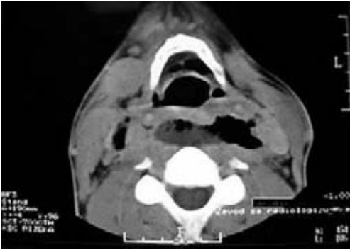
Figure 1. CT of the neck: fluid and gas collections in the retropharyngeal compartments.