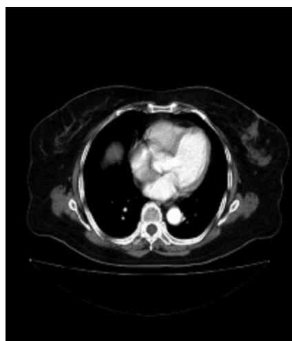
Figure 2. Computerized tomography. Diffuse wall thickening of the gastric antrum, which is in direct contact with the wall of duodenum and suppresses pancreas.