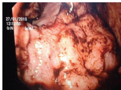
Figure 1. Gastroscopy - tumor presence in the gastric antrum.

occurrence was associated with other gastrointestinal diseases. Therefore, the fact that there are only few reported cases limits our understanding of primary mantle cell lymphoma from a clinical and therapeutic viewpoint. We present a case where MCL was not associated with any other gastrointestinal pathological condition, even though Chron's disease and adenocarcinoma were taken into consideration. Current experiences with treatment of MCL are very poor and there are no proven and standard regimes used in therapy. Effective treatment of gastric MCL still remains a very controversial issue with very poor response rates. Therefore, mantle cell lymphoma has a very poor prognosis. In the light of everything said, one should always consider a primary mantle cell lymphoma if a solitary gastrointestinal polypoid tumor is discovered, especially if no other gastrointestinal diseases are present.