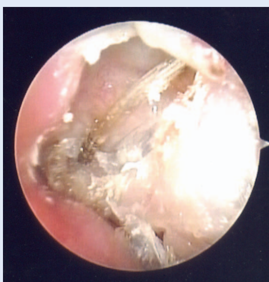
Figure 4. Intraoperative finding of the cochlear electrode extruded in the ear canal.

The exploration of the mastoid and the cavum tympani was performed. In the mastoid there was no sign of infection. Posterior ear canal wall was intact. In the cavum tympani a collection of purulent discharge was found around the electrode at the level of cochleostomy. Only 5 mm of the electrode was in the cochlea and the rest was extruded. No other pathology in the middle ear that could lead to extracochlear extrusion of the electrode was found.