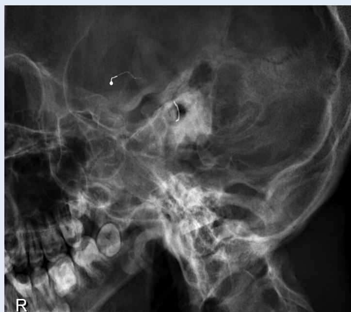
Figure 3. Schüller X-ray reveals cochlear electrode completely expelled outside the cochlea.

During surgery, it was found that the electrode was completely out of the cochlea and the cochleostomy site was clogged with fibrous tissue. The ear was dry and there was no sign of inflammation.