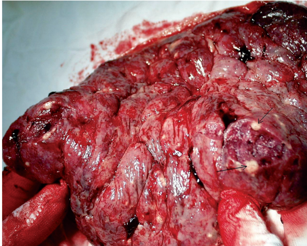
Figure 2. The maternal surface of 38-week placenta from 31 year old primigravida with LM infection. Transverse cut reveals white-yellowish nodules (black arrows) in intervillous space.

tissues of the aborted fetuses. At days 2 and 3 p.i., the placenta was characterized by large, hemorrhagic necrosis in association with numerous bacteria which covered the entire organ, while the inflammatory reaction was confined to single granulocytes, but T cells and other cellular elements necessary for effective antilisterial defence were absent. It was obvious that immune response at the materno-fetal interface was insufficient to control bacterial proliferation in placental tissue. During the course of infection, TNF- \alpha and occasionally, IFN- \gamma were transcribed in placental tissue. Increased levels of these anti-listerial cytokines were not sufficient to control bacterial growth, but may eventually contribute to spontaneous fetal loss and poor pregnancy outcome.