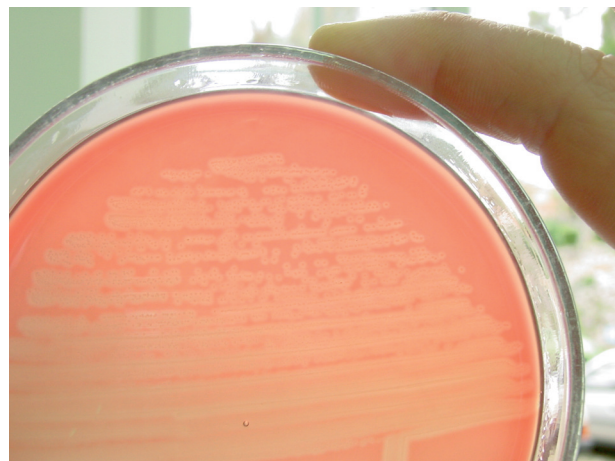
Figure 1. LM is beta-hemolytic on sheep blood agar plates but often produce only narrow zones of hemolysis that frequently do not extend much beyond the edge of the colonies.

generally considered to be saprophytic. Weak \beta -haemolysis on blood agar is one of the features to differentiate pathogenic LM from harmless strains like L. innocua (Fig. 1).