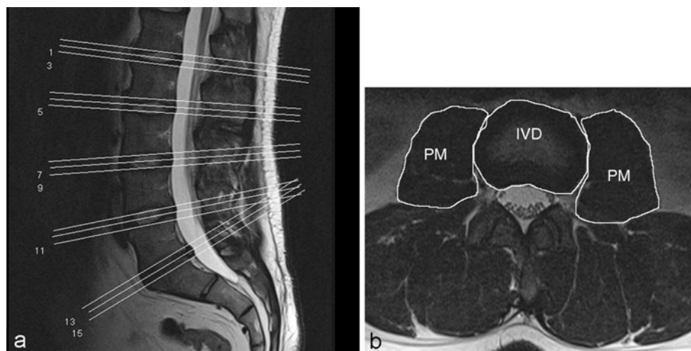
Fig. 1 Transverse oblique MR images parallel to the referent intervertebral discs of the lumbar spine (a). The circumferences of the psoas major muscle (PM) and intervertebral discs (IVD) on the T2-weighted modified axial scan (b)