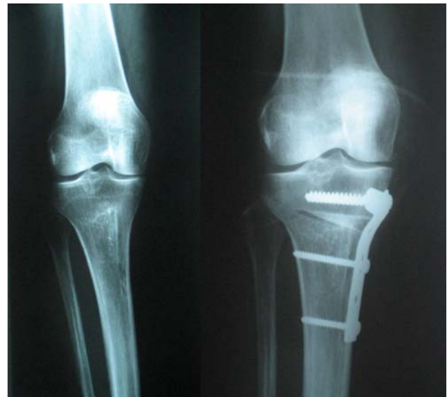
Fig. 1 Preoperative and immediate postoperative anteroposterior radiograph after a medial opening wedge high tibial osteotomy using a cancellous bone allograft and fixation with AO plate and screws

The standard operation technique was performed using a tourniquet and spinal anaesthesia [10]. Care was taken not to break the lateral cortex during the tibial osteotomy in order to preserve some degree of stability between bone fragments [15]. The bone allografts used were parts of femoral heads stored at -80^\circ\text{C} . They were unfrozen prior to application in a suitable physiological medium for approximately 30 minutes at room temperature. Internal fixation was done with a T-profile AO plate (Fig. 1). The internal fixation plate was removed 12 to 18 months after the operation.