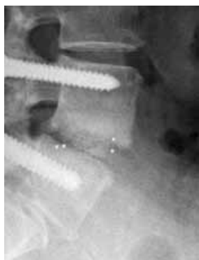
Fig 4. CT after 6 months reveals signs of pseudoarthrosis.