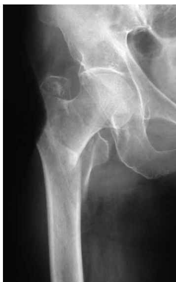
Fig. 1. Preoperative AP radiograph of the hip shows unstable trochanteric femoral fracture with grade I osteoarthritis of the hip according to Kellgren-Lawrence grading scale.

Between 2000 and 2005, 50 patients with unstable trochanteric femoral fractures (41 women) aged 75 to 92 years (mean, 86 years) underwent cemented hemiarthroplasty involving the Austin-Moore endoprosthesis design. Out of them, 21 had left and 29 right unstable trochanteric femoral fracture. They were all able to walk independently before the fracture only with the help of a walking stick or crutches. Patients who were highly mobile or immobile before the fracture, those with a malignant disease, hip osteoarthritis grade II, III or IV according to the Kellgren-Lawrence grading scale 14 (Figure 1), a subtrochanteric fracture or with propagation of the fracture in the diaphysis of the femur were excluded from the study. All of them suffer from some concomitant disease and are under therapy for a certain cardiovascular disease, and 78% of them have a history and therapy of osteoporosis. Other concomitant diseases included diabetes mellitus (9%), epilepsy (6%), cholelithiasis (6%) and hepatic cirrhosis (6%). Some of them had a combination of several different diseases (e.g. hypertension, heart failure and diabetes mellitus). We classified unstable trochanteric femoral fractures in our patients according to the Jensen modification of the Evans classification of