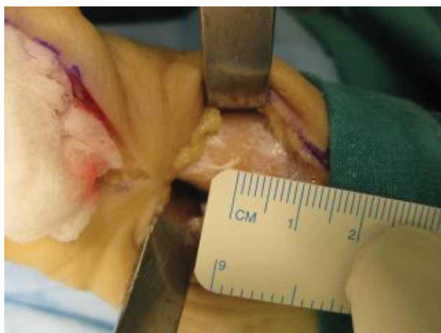
Fig. 5. The osteotomy is situated about 1–1.5 cm proximal to metatarsal-cuneiform joint.

Following osteotomy, the medial capsule is imbricated with vicryl No. 2 over the resected metatarsophalangeal