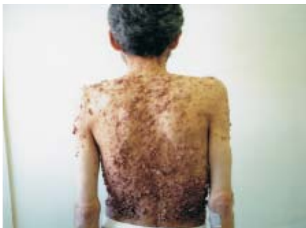
Figure 2. Patient with neurofibromatosis. The entire trunk is covered with cutaneous tumors.

side, cough, dyspnea, fever, and weight loss. His past medical history included congenital deformation of the right foot. Skin macular pigmentation and neurofibromas, first observed at the age of 13, increased in number and size. His mother, aunt, and grandfather from the mother's side, had similar skin changes, but smaller and fewer. His uncle underwent a surgical treatment for kidney polycystosis, whereas his sister has kidney cysts and her daughter a polycystic ovary (Fig. 1). Proband's mother and her daughter a polycystic ovary (Fig. 1). Proband's mother and aunt, both with neurofibromatosis, had surgically treated myoma and stomach carcinoma, respectively. At physical examination, the patient showed multiple neurofibromas and café au lait spots (Fig. 2) covering the whole body, particularly the trunk. The right tibia was 8 cm shorter than the left one, with hypotrophic musculature, and the right ankle was deformed, with 0 degrees of flexion and 15 degrees of extension.