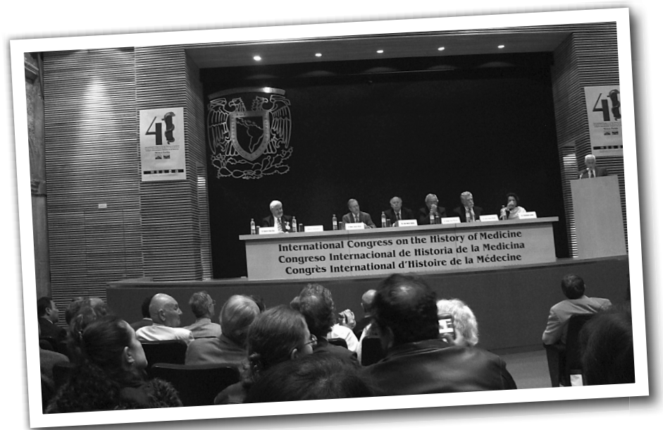
Congress opening ceremony Svečano otvaranje kongresa