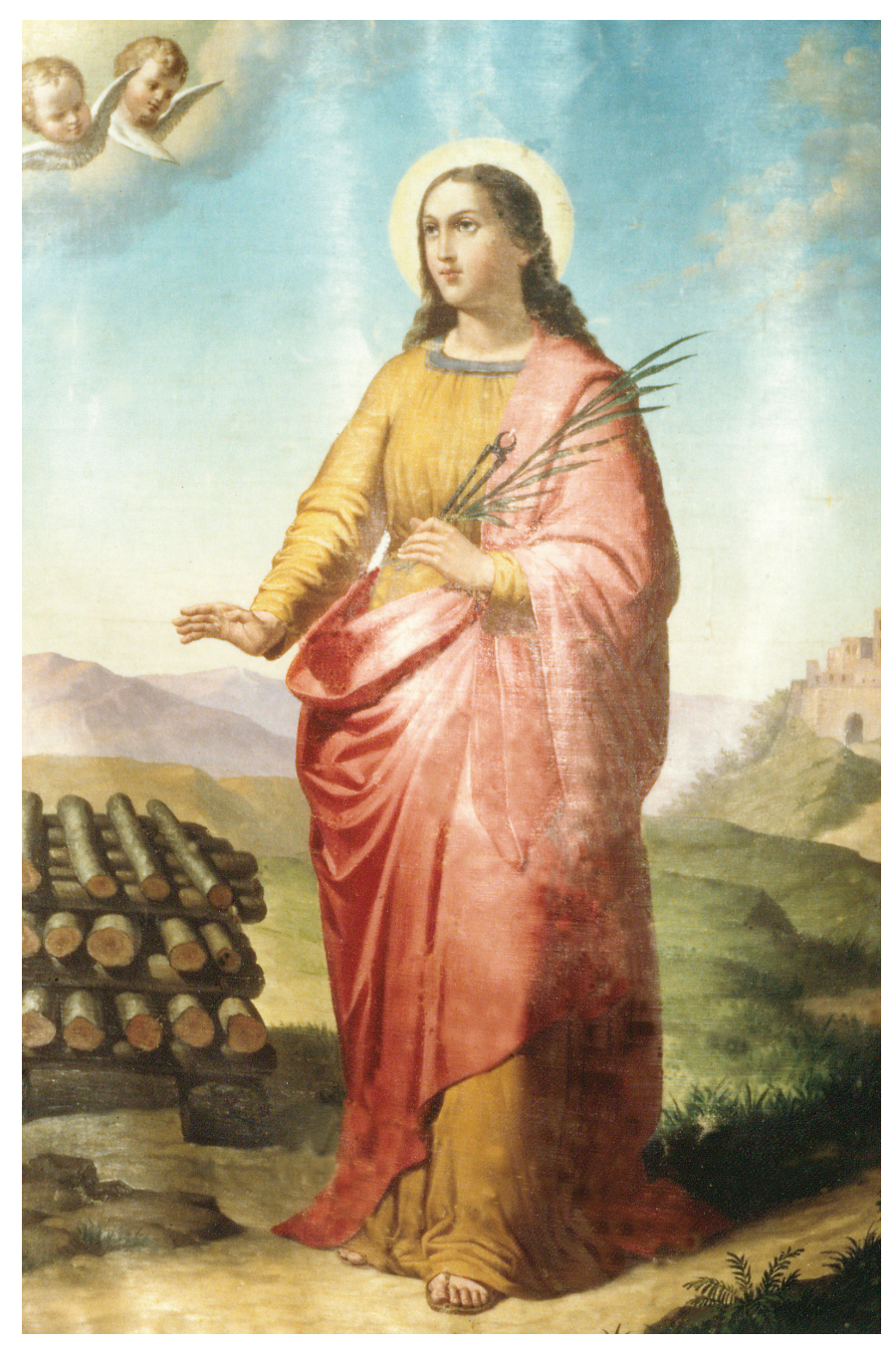
Figure 1 The traditional illustration of St Apollonia the martyr with her typical symbols