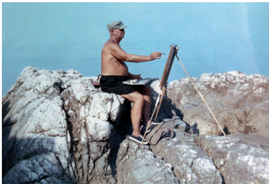
One of the pleasant days in retirement, behind the easel at the seaside on the island of Krk

Even though he had published a few notable early papers before WW2, his scientific career peaked in the postwar period. His opus includes fifteen notable research and professional papers, and shows a wide spectrum of interest in infectious diseases and contiguous areas of research, from classical infectious diseases to new epidemics and novel solutions - often his