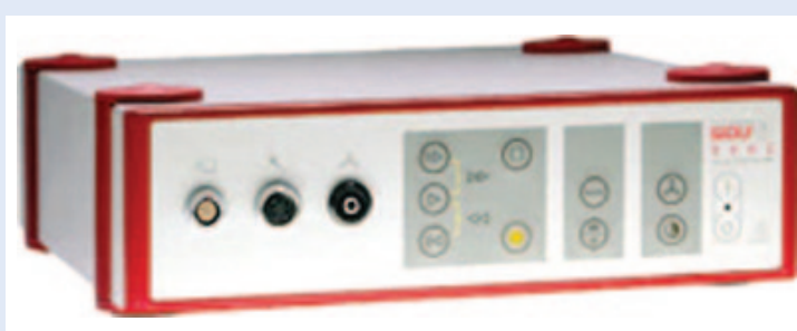
Figure 1. Outlook of the endocamera made by Richard Wolf GmbH (Knittlingen, Germany). Model used herein was labelled "Richard Wolf 5562 Endocam®".

in laryngology 3 . Since the first observation of the layered microstructure of the human vocal fold made by Hirano advanced diagnostic and surgical methods to raise voice quality. Stroboscopy has been initially developed as the most objective and practical method for clinical evaluation of phonatory mucosa 4 . Introduction of endocam into everyday clinical practice has improved diagnostic possibilities and, as well, provided laryngologists with various new treatment options 3 . Endocamera can be used to diagnose and treat a great number of disorders that have, until now, remained in the realm of a subjective estimation occasionally limited by the vision and expertise.