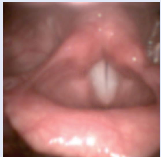
Figure 4. Complete disappearance of hematoma and resolution of vocal fold's mucosal oedema.