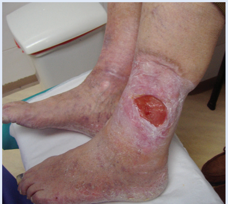
Figure 1. Ulcer cruris

tia. According to intense wound pain, 58 patients were further analyzed. They were undergoing peroral analgesic therapy and silver-releasing foam dressing for treatment of leg ulcer. Among them, 28 patients were prescribed ibuprofen-releasing foam dressing without peroral analgesic therapy, while 30 patients continued peroral analgesic therapy with silver-releasing foam dressing as a control group. The primary endpoint was to determine wound pain relief in the first two days