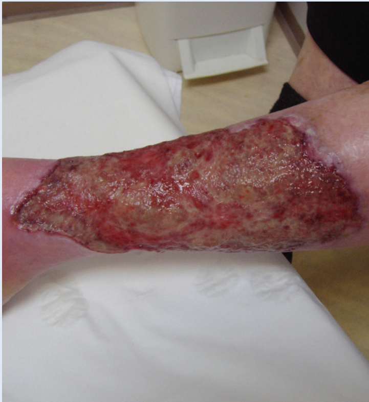
Figure 2. Ulcus cruris