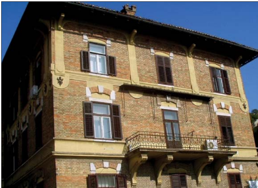
Building that hosted the first microbiological laboratory in Fiume (Rijeka) founded in 1899.

Zgrada u kojoj je 1899. osnovan prvi mikrobiološki laboratorij u Rijeci