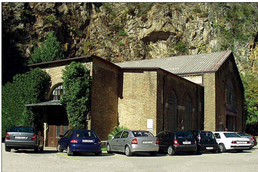
Building of the former waste incinerator, now used as a warehouse Zgrada bivše spalionice smeća (sada skladište)

long experience in systematic and continuous chemical and microbiological food analyses, that only few European towns can share.