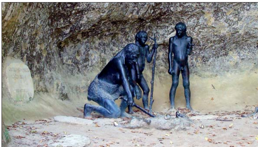
Krapina Man family in the Hruševo cave. Prikaz obitelji Krapinskog pračovjeka u polupećini Hruševo

world's largest collection of items from the Neanderthal times (Figure 4). The excavated artefacts included Mousterian-style flint tools (spikes, scrapers and daggers) belonging to a culture that knew how to use fire. The site is estimated to go back to the Palaeolithic, some 130,000 years ago.