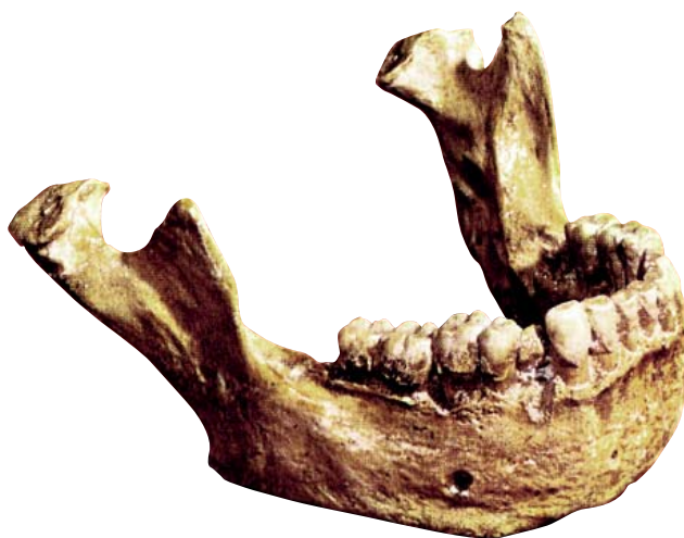
Lower jaw with visible traces of periodontitis and bone resorption. Krapina Neanderthal Museum

Some healed bones, however, suggest that these same tribespeople treated and cared for those in need. This sheds a new light on this extra-