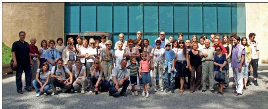
Tour group before the Krapina Neanderthal Museum Sudionici izleta ispred Muzeja krapinskih neandertalaca