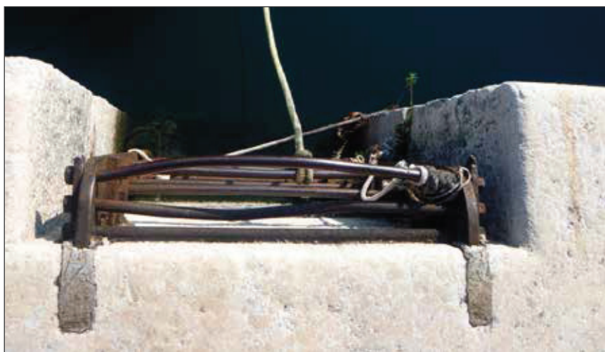
Figure 2 - Possible location of the mareograph/tide gauge at Fiumara

In the first book about climate in Fiume/Abbazia (Rijeka/Opatija), Salcher (1884) gathered and analysed 15 year data (1869-1884) from Fiume