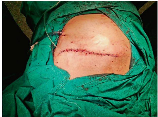
Figure 5. Primarily closed wound with a drain set up.

er, additional radiation might be limited for post-radiation UPS(9). Our patient was undergone to all of treatment options, including surgical and oncological procedure with successful results although he had one relapse of disease.