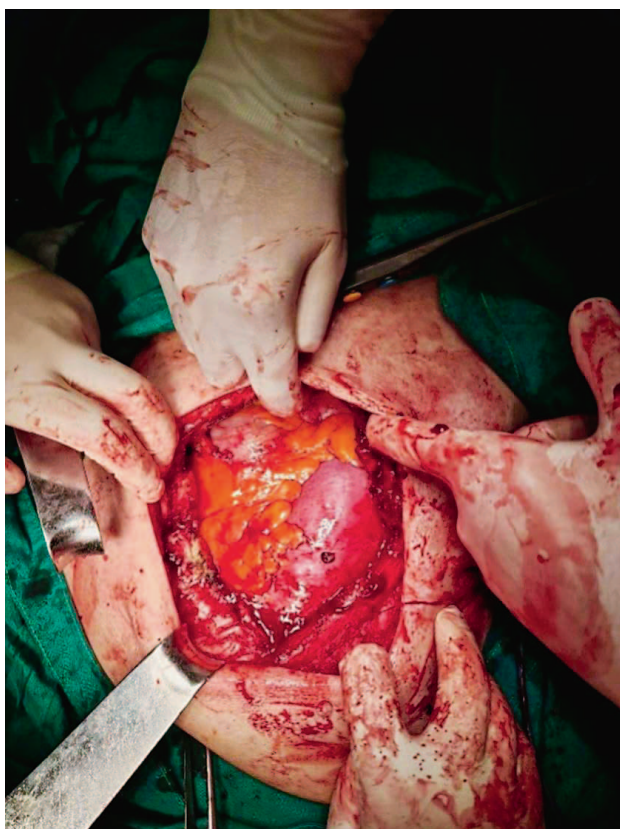
Figure 2. The condition after resection of the thoracic wall. Lung tissue and an orderly intrathoracic finding can be seen.