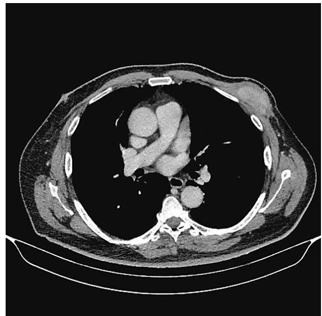
Figure 1. CT scan showing extensive relapse that infiltrates the large pectoral muscle and ribs, indicated by a blue arrow.

with inflammatory Undifferentiated Pleomorphic Sarcoma (UPS). Notable histological findings included spindle, round, and multinucleated CD68-positive osteoclast-like cells accompanied by pronounced neutrophilic and mononuclear cell infiltrates and a high mitotic index. Extensive necrosis and hemorrhagic areas were also evident within the tumor. The excised tumor tissue measured 4.5 cm in diameter. Due to such pathological findings we indicated radical operative treatment so mastectomy was done with Stewart's incision for approach resulting in complete removal of the left breast and underlying major pectoral muscle fascia. Pathohistological assessment revealed residual necrotic tumor remnants from the previous operation; however, the resection margins exhibited no evidence of malignant cells. Subsequent to this intervention, the patient underwent a PET CT scan that reveal the multiple lungs metastases. In response, oncological intervention was recommended and pursued at an alternate clinical facility. The patient received six cycles of doxorubicin chemotherapeutic treatment with successful response upon which the metastases have receded. Three years after the initial surgical intervention a CT scan indicated local recurrence of the tumor within the left thoracic wall, but without distal metastases. This recurrence was characterized by two dis-