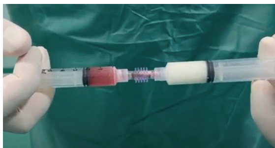
FIGURE 3. Combining microfragmented adipose tissue with platelet-rich plasma for the application of the combined product into the urethral defect.

tive properties of both components, offering a promising approach for canine medical treatments.