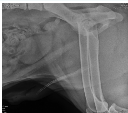
FIGURE 4. Positive contrast-retrograde cystography showing no contrast leakage. The adipose tissue harvesting site healed uneventfully. One year after surgery, the patient urinated independently and was asymptomatic.

Stem cells have long been used in orthopedics, particularly in the treatment of osteoarthritis, where they have not only