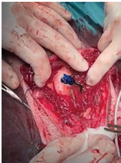
FIGURE 2. Application of methylene blue through the urinary catheter for the localization of the urethral fistula.

was combined with the previously obtained MFAT using the inter-syringe processing to create the final product, a mixture of MFAT and PRP, intended for therapeutic use (Figure 3). The mixture was then applied through a 16-gauge needle, around the sutures in the area of the urethral defect closure, with care being taken to avoid excessive tissue pressure. Tissue was easily compliant for an amount of 3 mL MFAT/PRP mixture, and the rest was used to freely “shower” the external urethral wall. This meticulous method of combining MFAT with PRP harnesses the regenera-