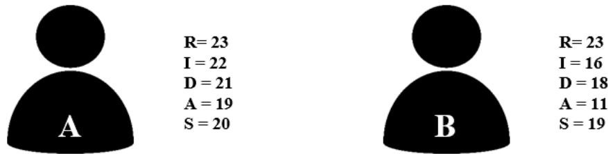
Figure 2: GDMS results of persons A and B