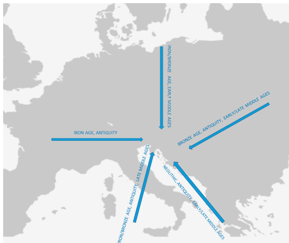
Figure 1. Proposed historic migration episodes in Southeastern Europe since the Neolithic period.

and the Slavs. The migration of the Slavs, whose impact shaped the linguistic landscape of the Balkans with the widespread usage of South Slavic languages seen today, has recently been documented through paleogenetic research [19]. Finally, there are assumptions that the expansion of the Ottoman Empire during the late medieval and early modern periods in this part of Europe also initiated several important local migrations (Figure 1).