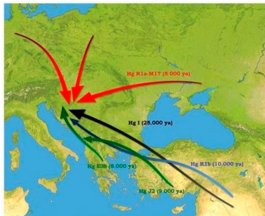
Figure 2. Proposed migration routes for the main observed haplogroups in the modern Croatian population [36].

In 2011, Primorac and colleagues published a comprehensive review based on population genetic findings published up to this point (Figure 2). The review suggested that around three-quarters of present-day Croatian men most likely trace their ancestry back to ancient Europeans who settled in the region both before and after the last glacial maximum. The remaining population was believed to be descendants of individuals who migrated to this area via the southeastern route over the past 10,000 years, primarily during the Neolithization process [36].