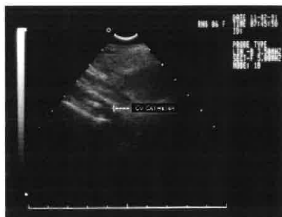
Figure 2. Ultrasonographic transversal presentation of v. anonyma (convex transducer; 5 MHz). Double echo in vein presents central venous catheter.

With the convex transducer (5 MHz) via suprajugular access, we visualized vena anonyma (Figure 2) and with the convex transducer (3 MHz) by a standard echocar-