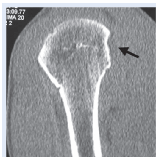
Figure 2. MRI showing the defect on the humeral head (Hill Sachs lesion)