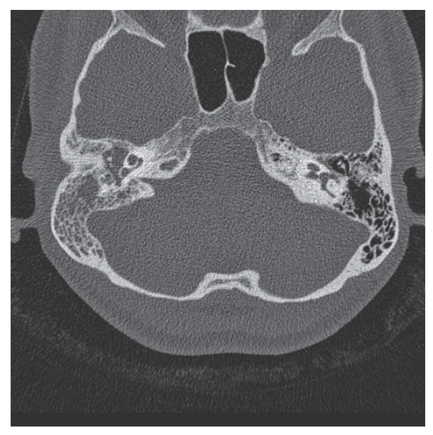
Figure 1 The initial axial CT scan through the right-side temporal bone shows total shadowing of the mastoid process and tympanic cavity

We do not have the results of the initial audiometry made at the Clinical Hospital in May 2009, but