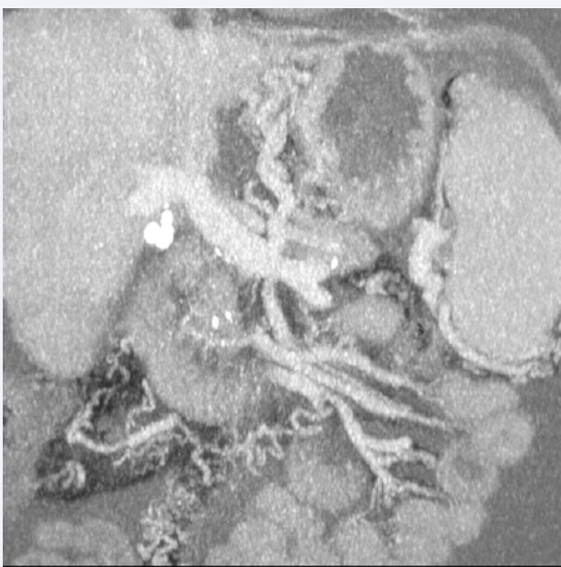
Figure 3 Control MSCT of the abdomen – complete regression of the portal and mesenteric vein thrombosis.

risk is not related to abnormal coagulation tests, which are not adequate to assess the risk of future thromboembolic incidents [3]; therefore, new routine tests for the assessment of this risk should be introduced. Serum albumin levels and partial thromboplastin time (PTT) values are independently associated with an increased risk of thromboembolic incident [3]. In our patient, the levels of albumin and protein C were decreased (Table 1); unfortunately, at the time of hospitalization because of a temporary laboratory technical malfunction we were unable to assess PTT, although it is a routinely performed test. Since the patient evidently suffered an incident that was simultaneously arterial and venous, we suspected a systemic coagulation disorder.