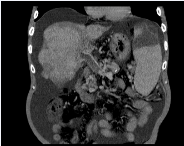
Figure 2 Abdominal multi-slice computed tomography indicating portal vein thrombosis, mesenteric vein thrombosis, and multiple spleen infarctions.