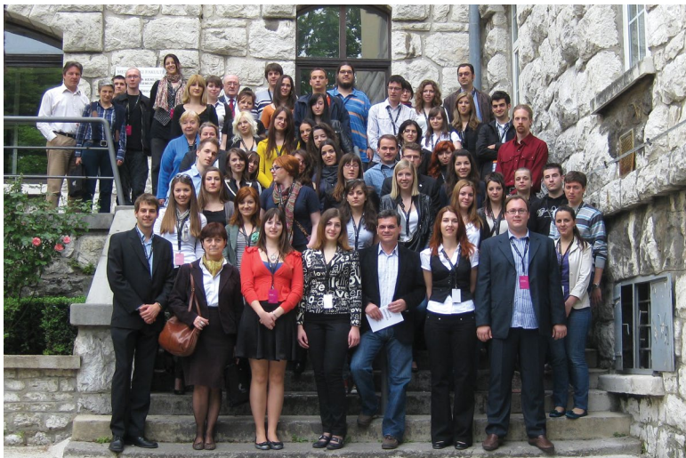
Participants of the 1 st Student Congress of Neuroscience – NEURI 2011; Faculty of Medicine Rijeka