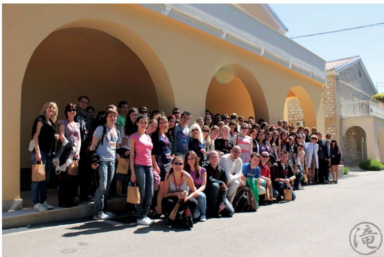
Participants of the 2 nd Student Congress of Neuroscience – NEURI 2012; Rab Psychiatric Hospital