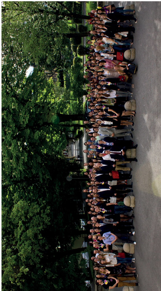
Participants of the 3 rd Student Congress of Neuroscience – NEURI 2013; Faculty of Medicine Rijeka