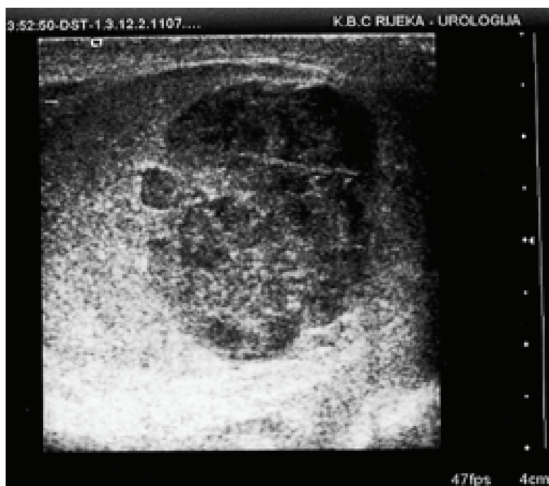
Figure 1 Ultrasound: hypoechoic focal lesion in the lower pole of right testicle.

Because ultrasound findings of the right testicle were highly indicative of testicular neoplasm, right radical orchiectomy was performed via an inguinal incision.